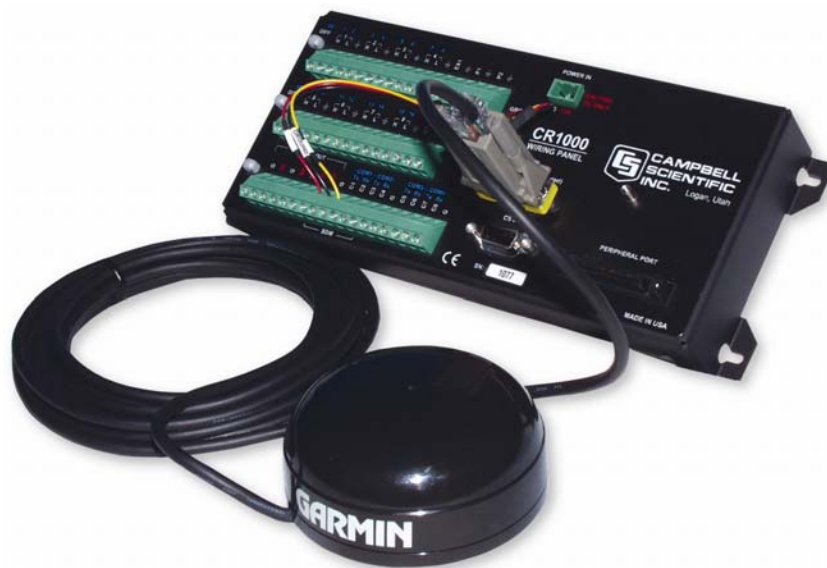
FIGURE 3. CR1000 to GPS16-HVS Using the 17218 Adapter